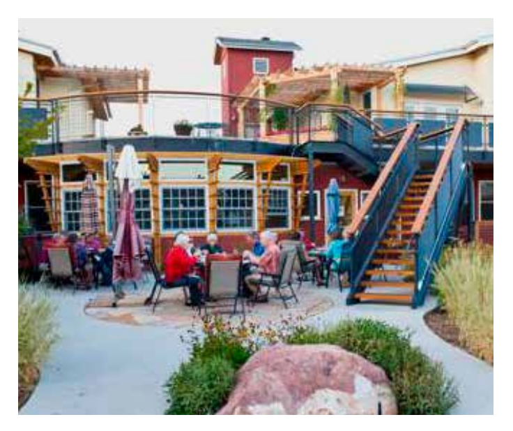
A Danish co-housing scheme for older people.

Most developments have high levels of environmental sustainability, the Passivhaus model which uses very little energy for heating or cooling, not only has 'green' credentials, but ensures that running costs are kept to a minimum. Other ways of reducing day to day living costs can, for example, be a common heating system, bulk food purchases, car pooling, or shared laundry facilities.