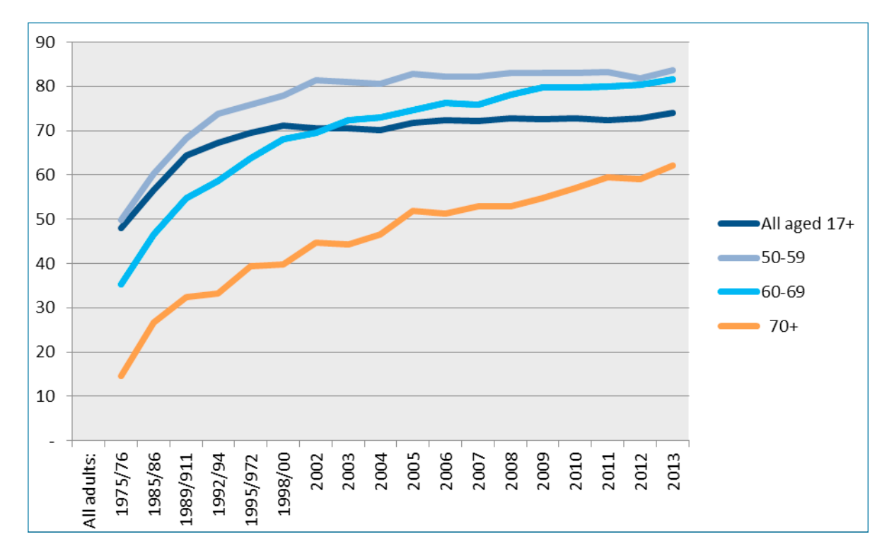
Figure 1: Percentage of driver licence holders by age categories in Great Britain between 1975 and 2013 (drawn from DfT, 2014).

This hyper-connectivity has seen a sharp rise in the number of drivers. In particular, older people's increase in the use of vehicles has been unprecedented. In 1975 only 15% of people aged over 70 years held a driving licence in Great Britain. This has risen to 62% nowadays (DfT, 2014; see Figure 1). Across all ages, miles travelled by car has fallen over the past 20 years, by around 8%, however for those aged 60-69 and those aged 70+ miles driven have increased (37% and 77% respectively; DfT, 2014), though they drive fewer miles than middle aged individuals.