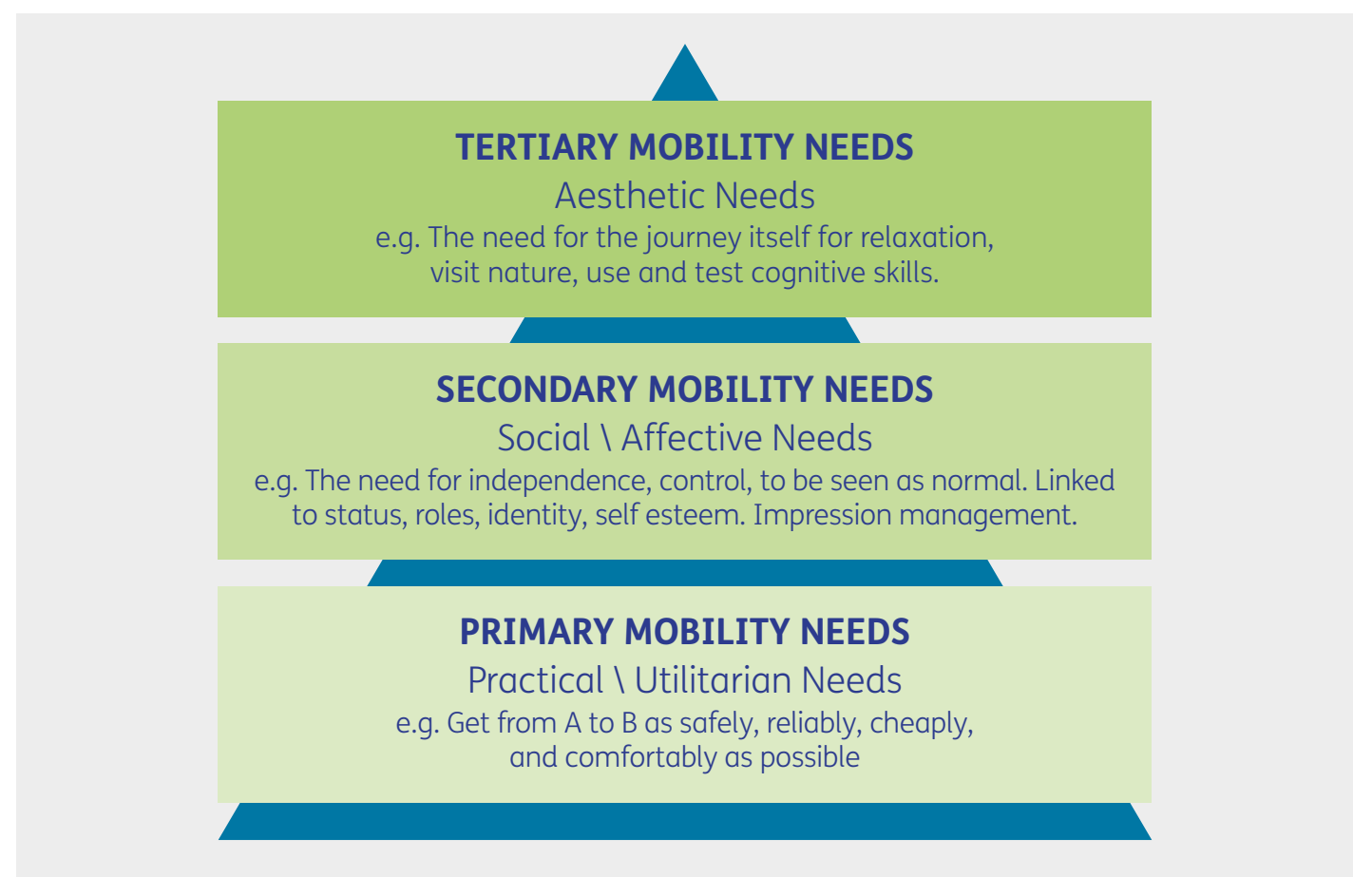
Figure 3: Hierarchy of older people's mobility needs (after Musselwhite and Haddad, 2010).

Some older people do give up driving successfully; this best occurs where a great deal of planning has taken place over time, with long periods of trialling out new modes and destinations or where there are locally living very supportive family members (Musselwhite and Shergold, 2013). Bringing the need to give up driving into the consciousness of older people can be hard even when it begins with trusted family members. As Coughlin et al. (2004) point out the discussion with family members is not always harmonious and although almost 60% followed the advice given by family members, over half of these were